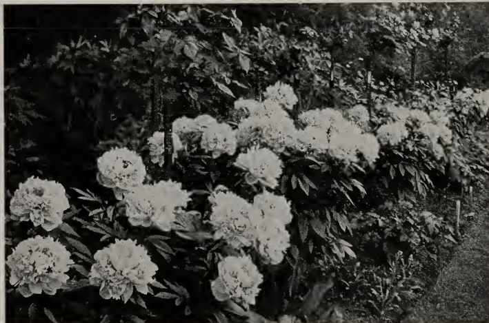
Baroness Schroeder, Royal Variety (See Page 7)

Having a large stock from which I send out only plants of my own growing, I can warrant the authenticity of the varieties. I have been most careful in purchasing stock from thoroughly reliable sources.